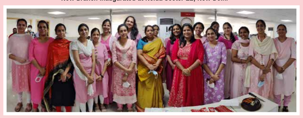
Women's Day celebrations at SIB Retail Banking Department